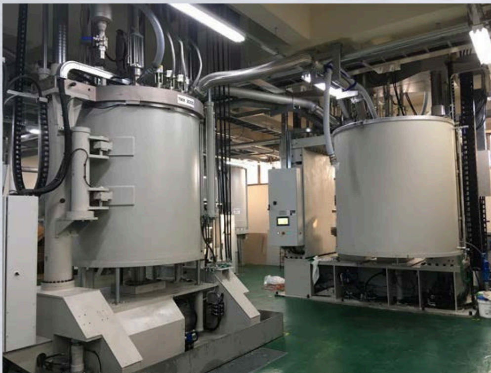
From left to right TMX and TPM