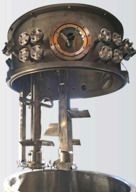
Mixing shafts detail